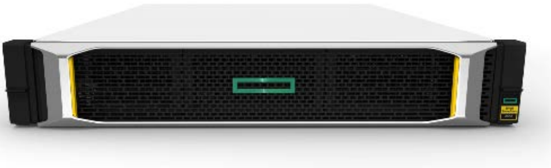
HPE MSA 2052 SAN Storage