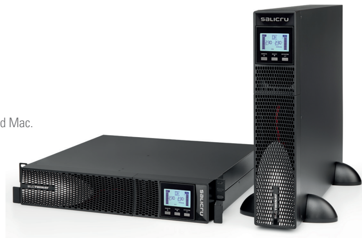
SLC TWIN RT2